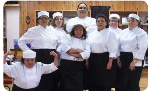
The first group of Remote Line Cook participants

In February 2013, Anishinabek Employment and Training Services launched an innovative five week Remote Line Cook training program designed to prepare candidates for the growing opportunities in remote mining and outfitting camps. Developed by OTEC and based on the national emerit Line Cook occupational standards and training program, the pilot program brought in-class learning together with practical skills training from a Red Seal Chef provided by industry partner Wilderness North. The program culminated in an engaging "Iron Chef Challenge," where each participant prepared dishes and presented them to the judges.