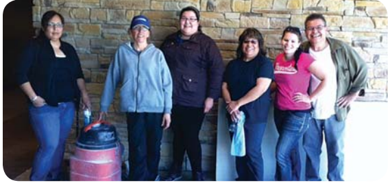
Participants from the training program prepare to open the new hotel

Long-time partners OTEC and Great Spirit Circle Trail teamed up earlier this year to integrate emerit Occupational Skills Training into the recruitment process for the new Manitoulin Hotel and Conference Centre to secure a dedicated and highly trained workforce. OTEC delivered a series of five day training programs based on the emerit National Occupational Standards for Front Desk Agents, Housekeeping Room Attendants and Food and Beverage Servers. After completing their training, participants challenged their occupation's emerit Professional Certification exam and as a result, 20 participants were offered employment at the new hotel & conference centre.