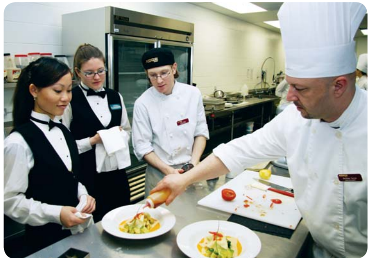
Algonquin College culinary students practice their skills.

Working through the RTO network, OTEC has begun to work with stakeholders, including the Workforce Planning Boards, to align regional labour market research toward more consistent results across regions.